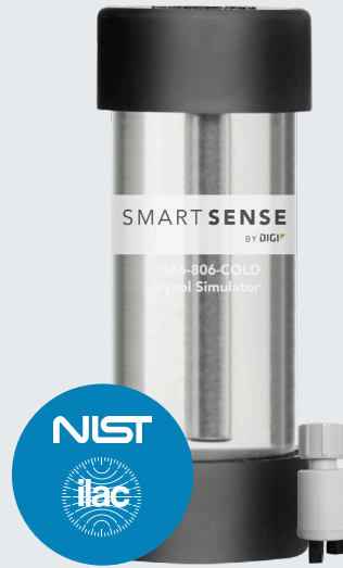
SmartSense NIST Probes

It's a painless twist on calibrations that takes seconds, resulting in zero interruption to temperature readings. Never again return a sensor to the manufacturer.